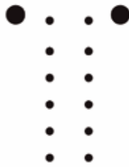
VENOMOUS/DANGEROUS Venenoso / Peligroso